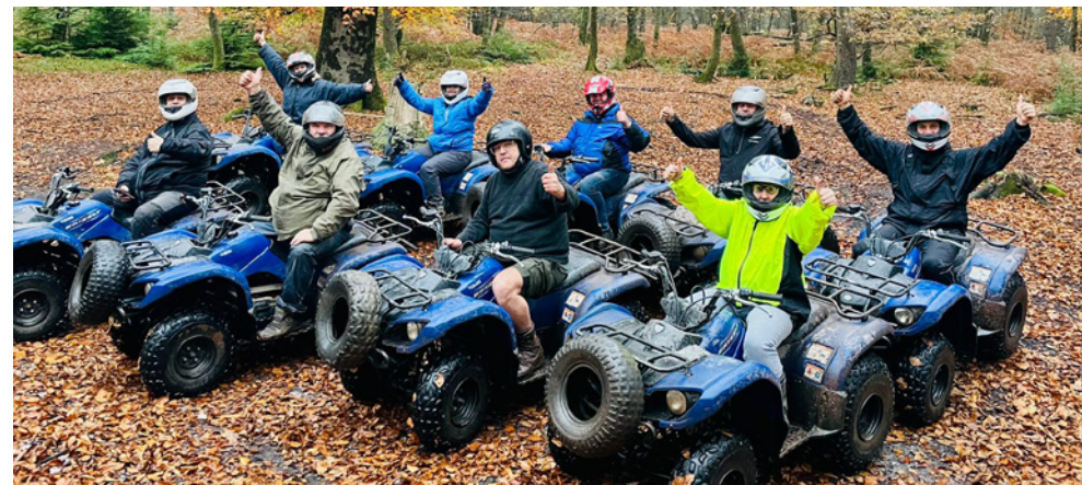
A group of beneficiaries enjoying a ride on some quad bikes in Devon

"Brilliant events for both veterans and their partners. Builds confidence, and helps with feelings of isolation."