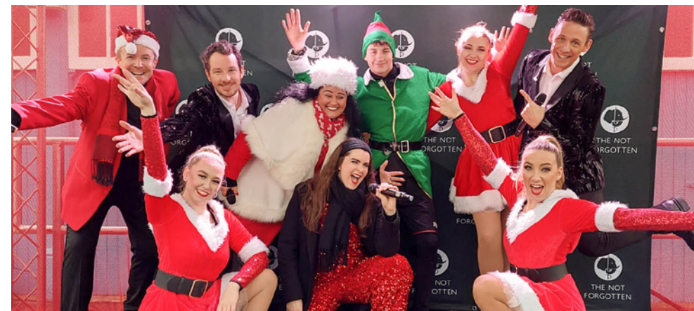
Our entertainment group pose at one of the Jingle Bell Rock Drive-In concerts

Our calendar was full once more this year, with a long-awaited return to the ski slopes of Breckenridge and respite weekends on the Ashcombe Estate. Although we weren't able to run a full calendar due to the pandemic, over the year we were able to support 398 veterans and serving personnel across 15 trips.